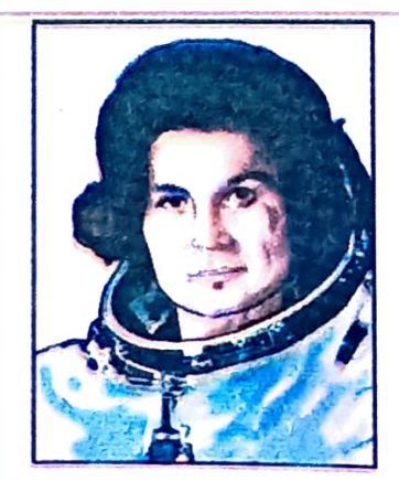
Valentina Tereshkova was the first woman in space and also one of the youngest female astronauts in history.