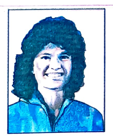
Sally Ride was the first American woman to go into space.