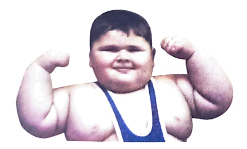
A fat boy