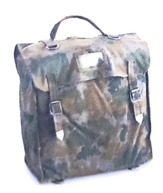
An old bag