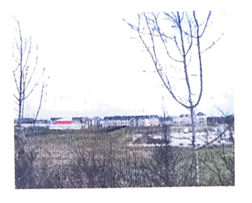
A d—ll day.