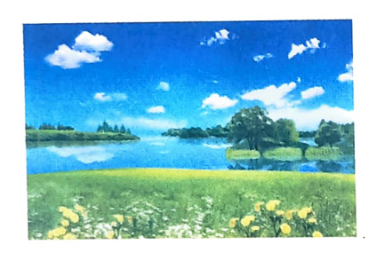
A bright day

1. Look at the pictures and fill in the blanks using the letters given in the side box.