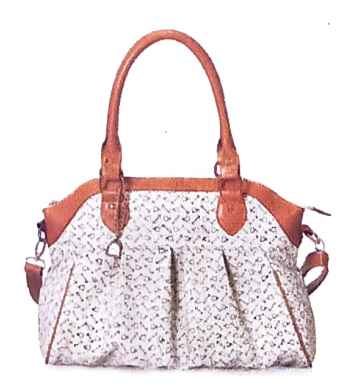
A n—w bag.