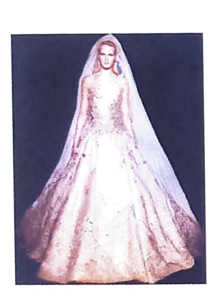
A beautiful dress